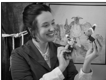
LEFT: Beatrix Potter Holiday by Atlantic Coast Theatre - November 30, 2011