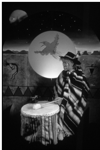
ABOVE: Hobey Ford Puppets Turtle Island Tales March 28, 2012