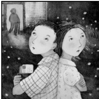
ABOVE: Salt & Pepper by Tarradiddle Players January 5, 2012