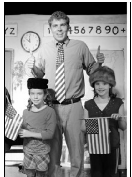
ABOVE: "Jack's Adventures in North Carolina History" by Bright Star Theatre November 3, 2011