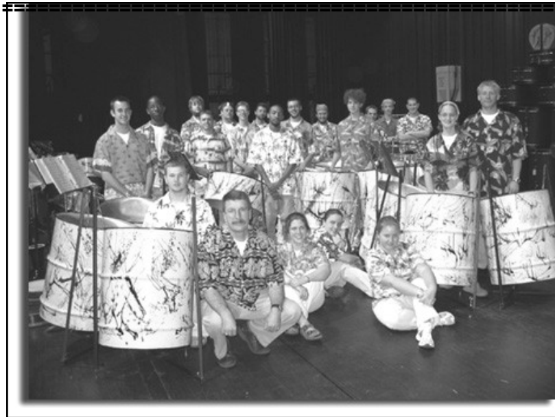
LEFT: Appalachian State University's Steely Pan Band will perform October 21, 2011

Grades K-3—Free A performance of songs and stories of Native Americans, told through puppetry. Among Native American people today, North America is sometimes called Turtle Island, a name derived from a myth of the Onondaga, a tribe of the Iroquois confederacy. Fabulous puppets delight and magically entertain. Curriculum Connections: Social Studies, Literature, Music, Drama