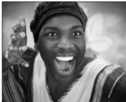
RIGHT: "African Folk Tales" by Bright Star Theatre— March 1, 2012