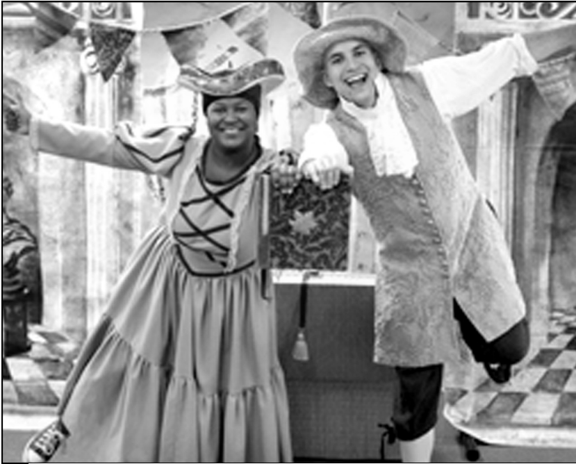
ABOVE: A Bright Star Children's Theatre production

Caldwell Arts Council Caldwell County Schools J.E. Broyhill Civic Center Bernhardt Furniture Company Comfort Inn Duke Power Foundation La-Z-Boy Foundation North Carolina Arts Council Western Art Agencies of North Carolina